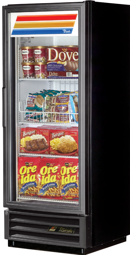
Shown with optional black exterior.