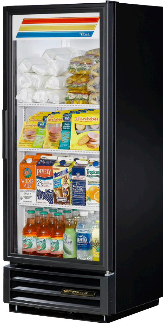
Shown with optional black exterior.